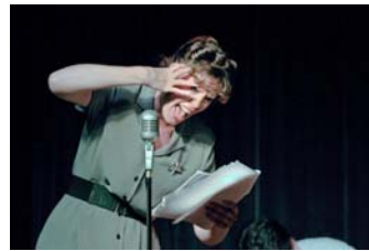
A performance from Renegade 2010

Festivals are what we do best in Greater Lansing, and there are three major ones to check out this month. Lansing JazzFest kicks things off on August 5 and 6 with local, regional, and national