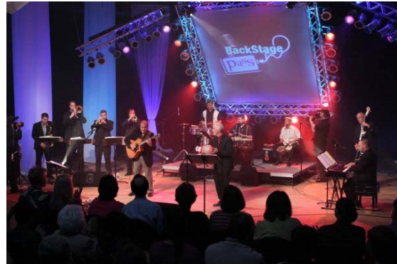
Live taping of Backstage Pass

Backstage Pass invites those interested to sign-up online to attend live tapings. For more information or to sign-up for a taping, visit their website , or become a Fan on Facebook .