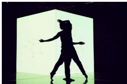
REPLICA, a collaborative performance piece funded in part by the USArtists Program