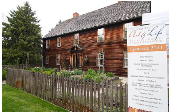
The Beekman Home