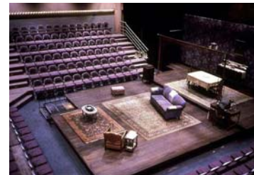
A classic thrust stage